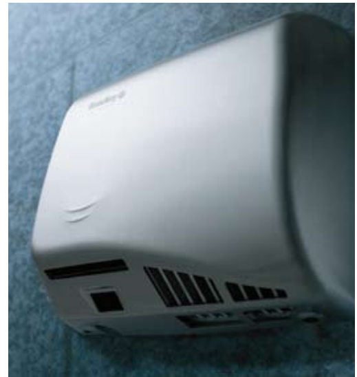
Aerix hand dryers are adjustable. Facility managers can turn the speed up for faster drying. Or, like Washington Township School System chose to do, the speed can be turned down for quieter operation.

“When you look at the big picture, Aerix Hand Dryers have substantially reduced our facility costs. In just the 18 months that we’ve used Aerix Hand Dryers, the reductions we’ve seen in both electricity and maintenance expenses have been remarkable.”