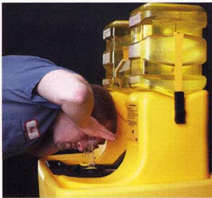
ANSI approved portable, gravity-fed eye-wash unit in use.

but emergency fixture manufacturers and other industry experts can offer guidance on which types of fixture are most suitable. HPAG