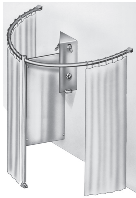
WS-2W-MS Privacy Shower: 2-station Econo-Wall multi-stall shower.