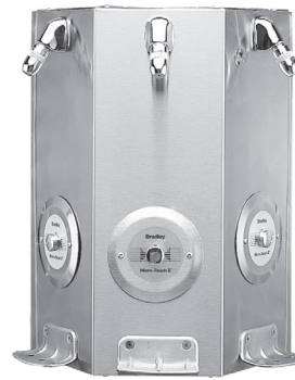
WS-3W Wall-Mounted Shower: 3-station shower with TouchTime® valve.