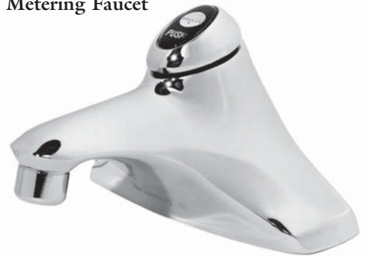
90-75 Metering Faucet

Heavy chrome-plated brass faucet is actuated by light push of button. Provides metering flow of water, for approximately 20 seconds. Unit complies with water and energy conservation requirements. Units can be furnished with Vernatherm mixing valve if desired.