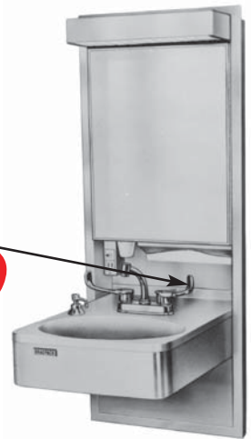
Hand Control with 4" Wristblade Handles

Two 4" wristblade handles provide temperature and volume control plus easy operation. Exposed trim is brass with polished chrome-plated finish. Gooseneck spout satisfies hospital design requirements.