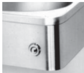
Handi-Tap Metering Valve

Valve is actuated by a push button located on front of bowl apron. Provides metered flow of water, adjustable for 5 to 60 seconds. Unit complies with water and energy conservation requirements. Units can be furnished with Vernatherm mixing valve if desired.