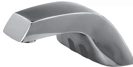
Futura Model 900

Chrome-plated, solid cast brass faucet is actuated when the user's hands enter a broad detection area within the lavatory bowl. Flow automatically stops when hands are removed. Flow rate is .5 GPM.