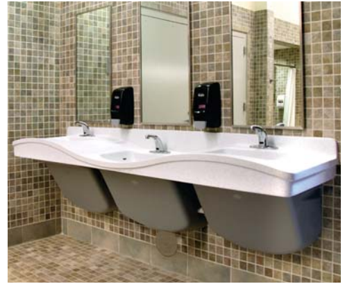
A multi-height lavatory system is universal and makes handwashing easy for all users, whether it's in an aquatic center, sports arena or educational facility.

"We call them our 'groovy sinks,'" Fortenberry said with a smile. "We thought the design was very cool and modern, and the seamless design will be easier to keep clean."