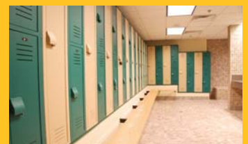
Solid plastic Lenox Lockers are available in a wide range of colors and sizes to fit virtually any application.