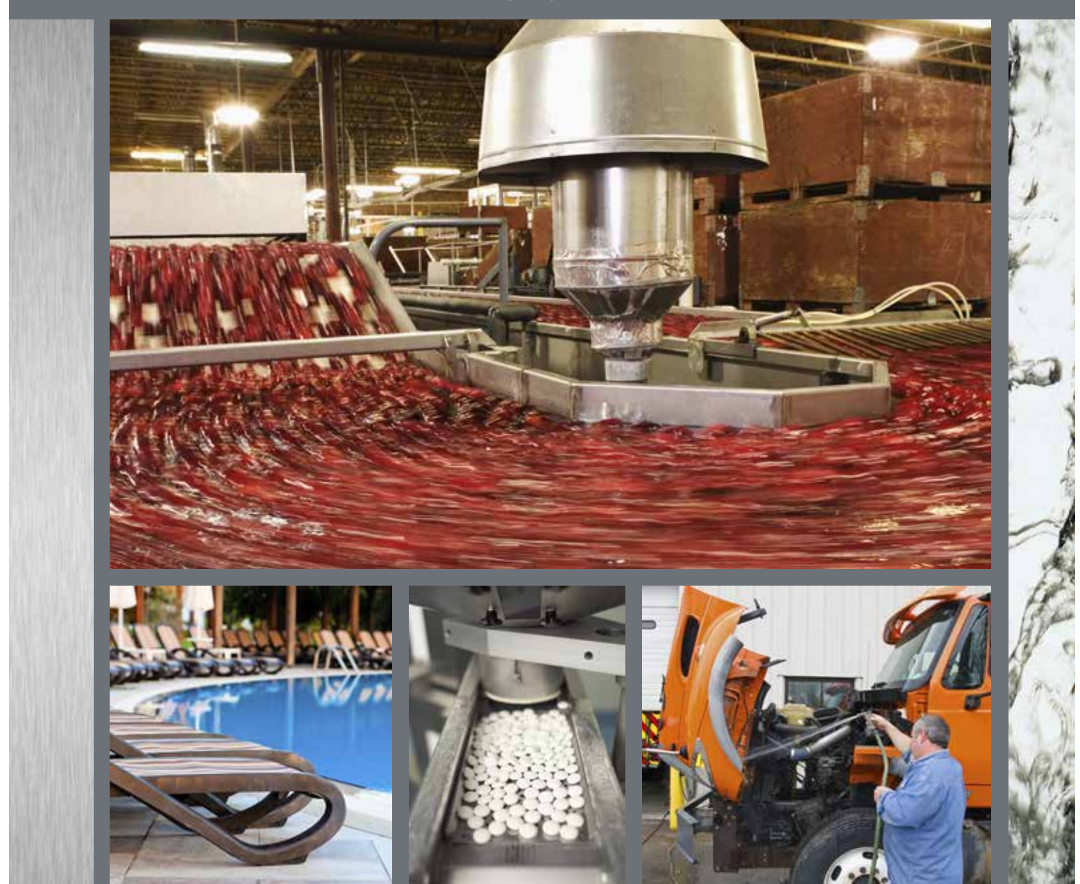
PRECISE. RELIABLE. DURABLE. TANKLESS.