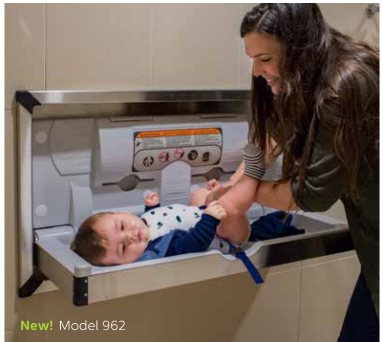
New! Model 962