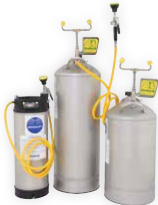
Model S19-672, Model S19-788, Model S19-690LHS