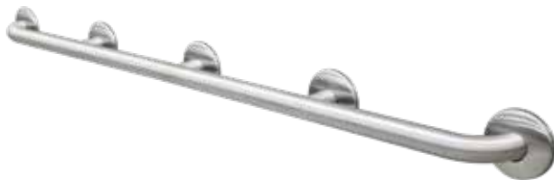
8320-106 Series 36" and 42" Bariatric rating to 1250 lb