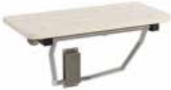
Model 9593 Bradmar Folding Shower Seat

Available in a variety of styles. Bariatric models rated from 500 lb to an industry leading 1200 lb.