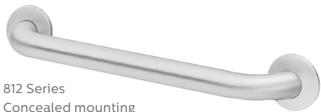
812 Series Concealed mounting

Always known for durability and reliability, Bradley grab bars are now stronger than ever and rated to 900 lb, 1000 lb and 1250 lb depending on the model.