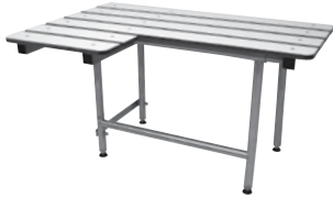
Model 957 Bariatric Bench Shower Seat