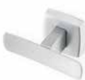
Model 9125 Double Robe Hook