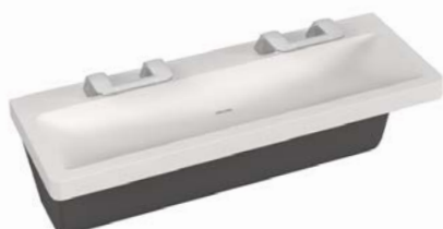
Express TLX Series with WashBar Duo