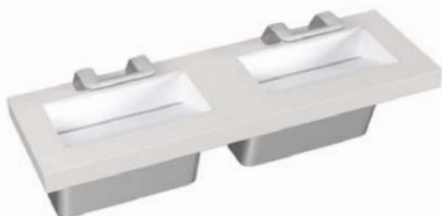
OmniDeck with WashBar Duo