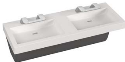
Express GLX Series with WashBar Duo