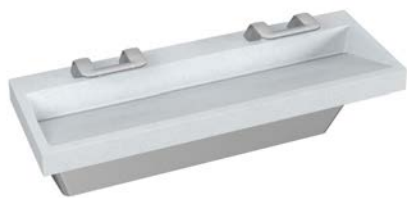
Verge LVA Series with WashBar Duo

The new Duo is available with the Verge® LVA basin in Evero® natural quartz, OmniDeck™ 3010 and Express® GLX and TLX Series Lavatory Systems in Terreon® solid surface, or as a stand alone unit.