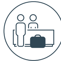
Atriums and Lobbies