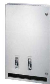
Napkin/Tampon Vendor Model 407