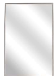
Mirrors Model 780