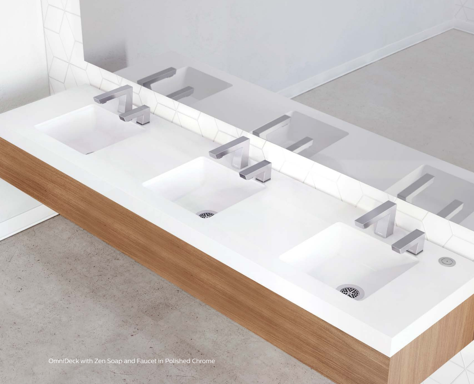
OmniDeck with Zen Soap and Faucet in Polished Chrome