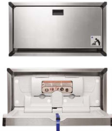
Baby Changing Station Model 962