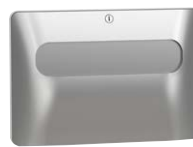
Seat Cover Dispenser Model 5A40