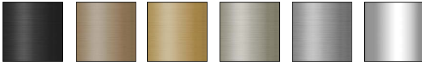
Brushed Black Stainless