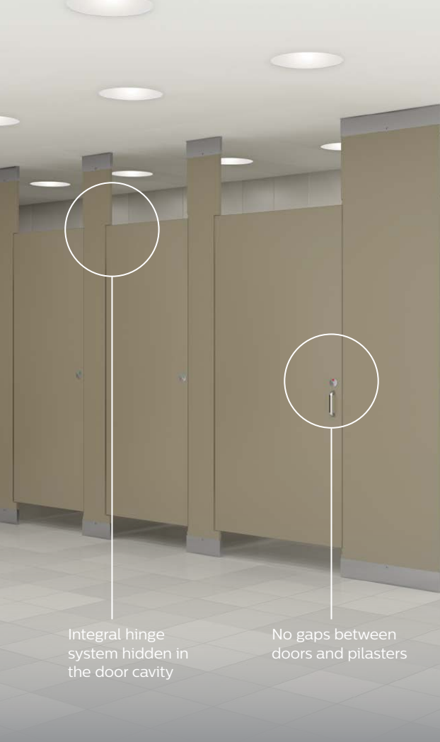
Integral hinge system hidden in the door cavity