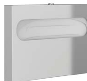
Seat Cover Dispenser Model 583