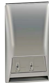
Napkin/Tampon Vendor Model 4A20