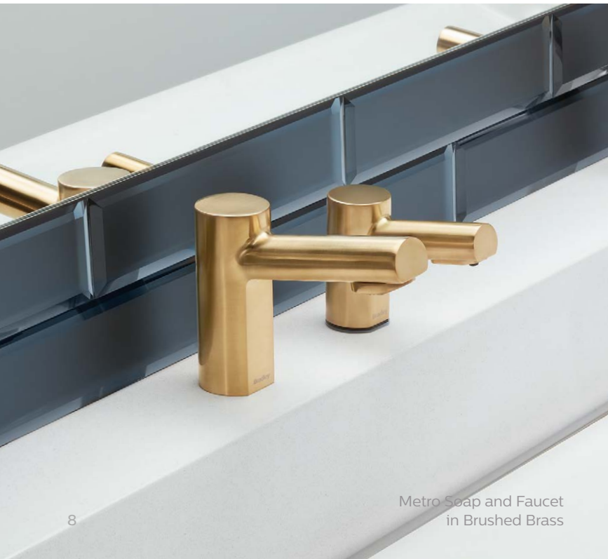
Metro Soap and Faucet in Brushed Brass