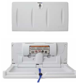
Baby Changing Station Model 9631