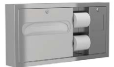
Seat Cover Dispenser and Dual Roll Tissue Dispenser w/ Waste Receptacle Model 5961