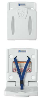
Toddler Seat Model 964