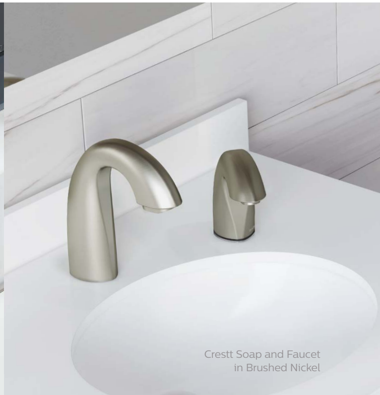
Crestt Soap and Faucet in Brushed Nickel