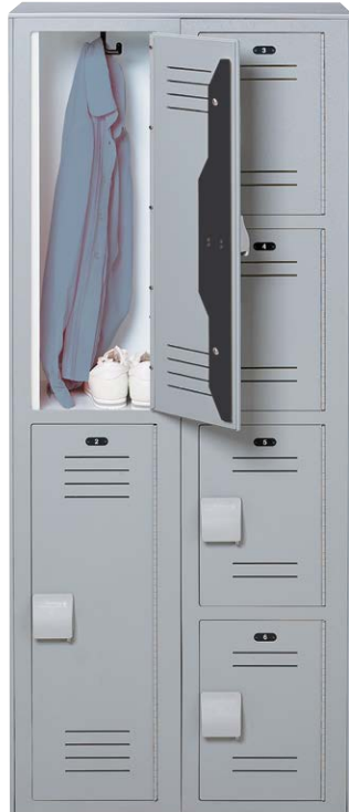
Two tier and four tier styles