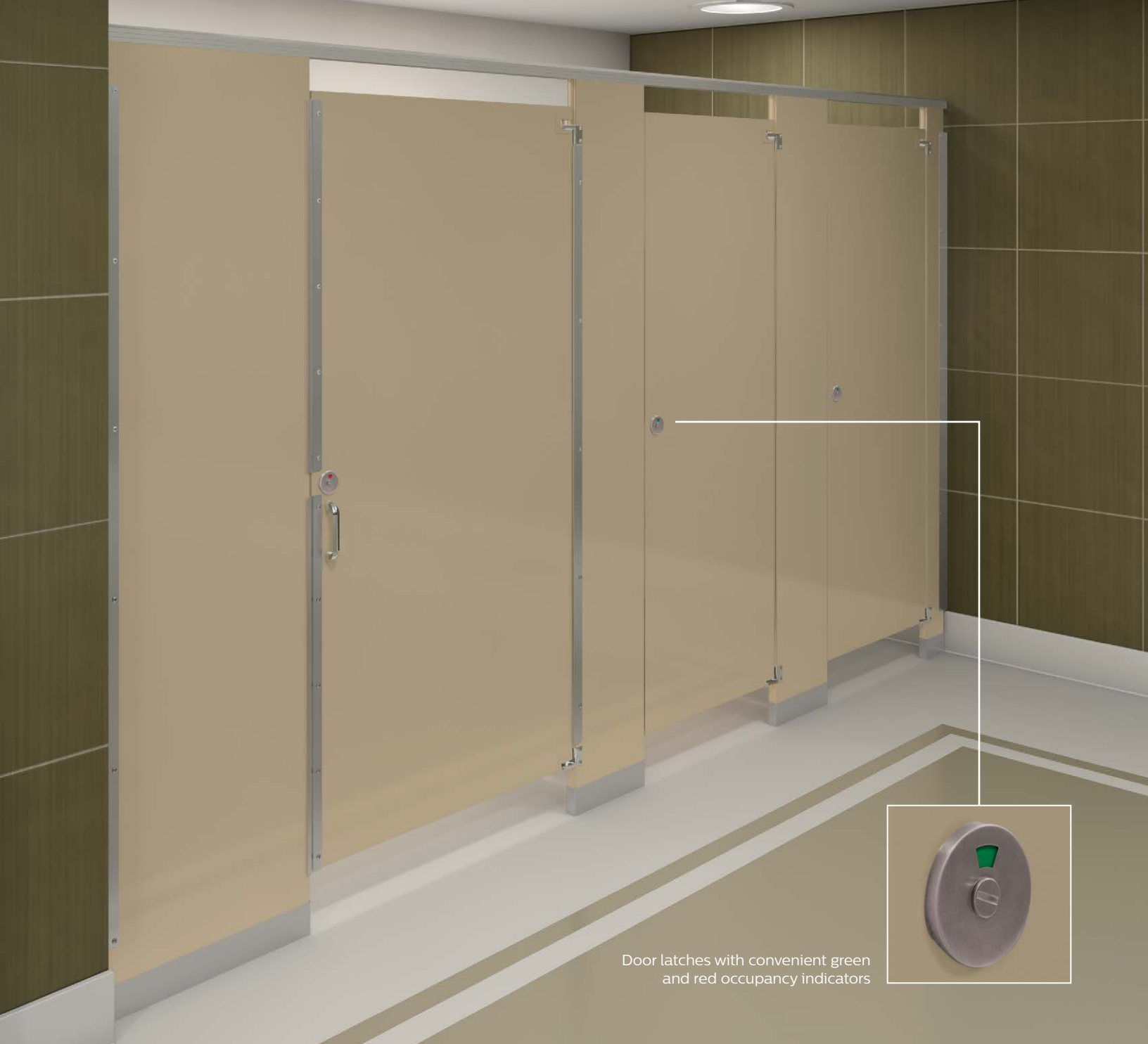
Door latches with convenient green and red occupancy indicators