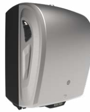
Fingerprint-free 304 stainless steel cover Model 2499