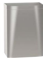
Waste Receptacle Model 3A15-11