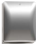
Towel Dispenser Model 2A10-11