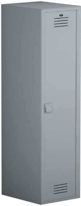
One tier with XL option shown with end panel