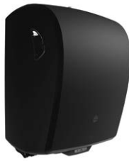
ABS high-impact plastic Model 2498