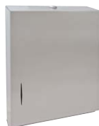
Towel Dispenser Model 250-15