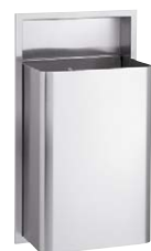
Waste Receptacle Model 334